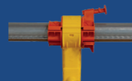
Long 3.14 in (High)