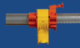
Short 1.9 in (High)

The best option to automate chick feeding